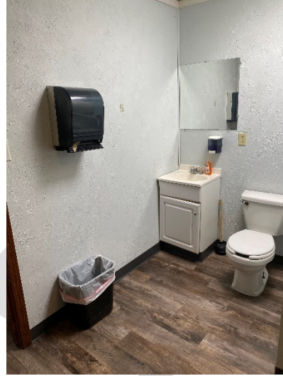
Unisex Restroom Overview