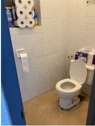
Unisex Restroom Toilet