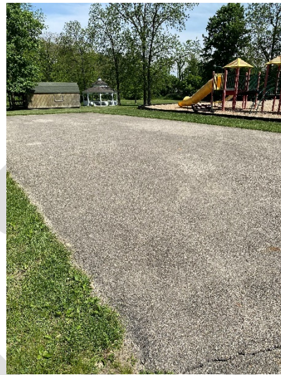
Parking Lot (2)