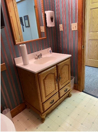
Unisex Restroom 2 Sink/Towel