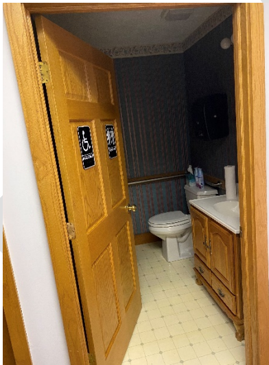
Unisex Restroom 2 Door