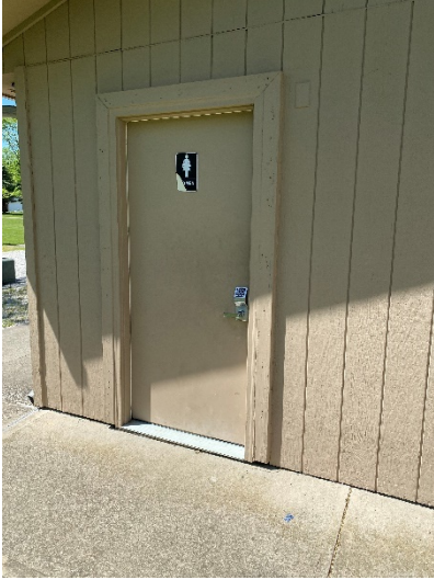
Women's Restroom Door