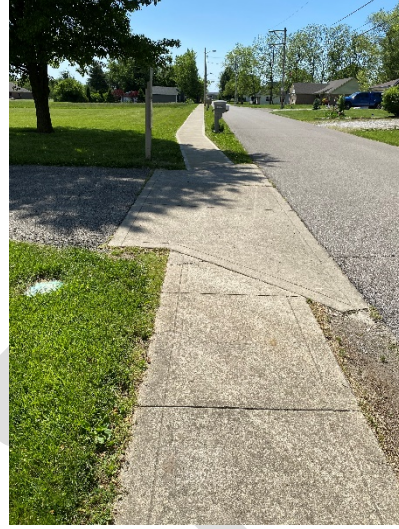
North Sidewalk (4)