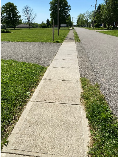
North Sidewalk (3)