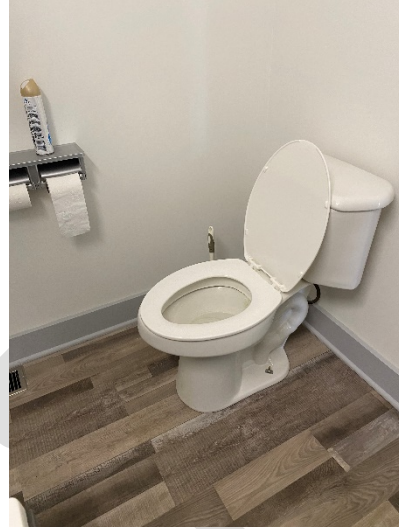
Unisex Restroom 1 Toilet