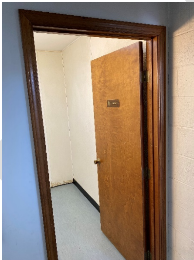
Men's Restroom Door