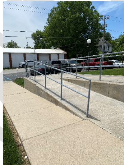
Front Door Ramp (2)