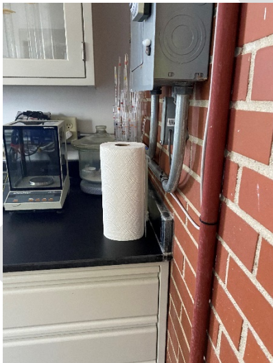
Unisex Restroom Towel