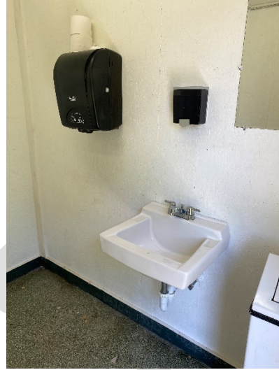
Women's Restroom Sink/Towel