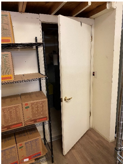
Unisex Restroom Door