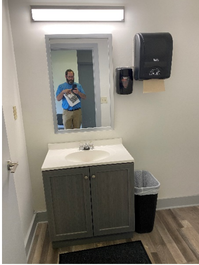
Unisex Restroom 1 Sink/Towel