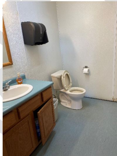
Men's Restroom Overview