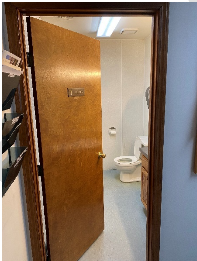
Women's Restroom Door