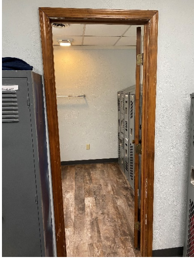
Unisex Restroom Door