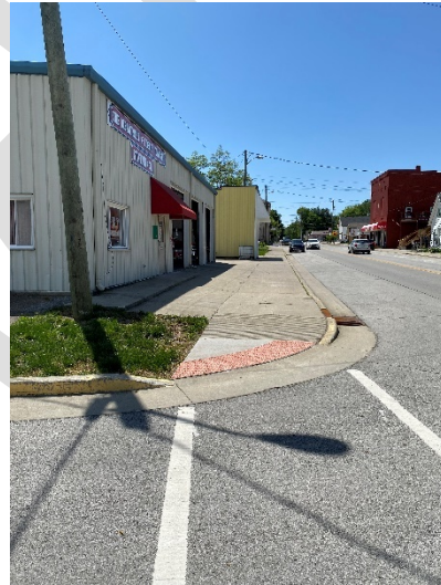
North Sidewalk (2)