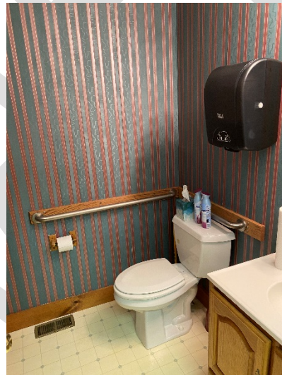
Unisex Restroom 2 Toilet