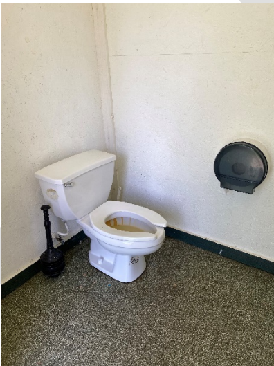
Women's Restroom Toilet