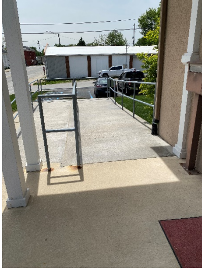
Front Door Ramp (3)