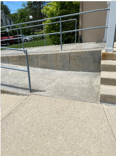
Front Door Ramp