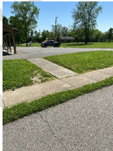
North Sidewalk (2)