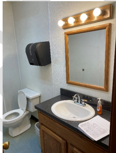
Women's Restroom Overview