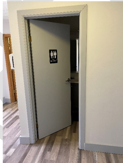
Unisex Restroom 1 Door