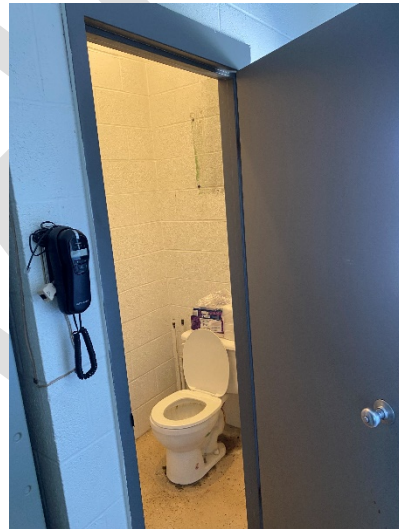
Unisex Restroom Door