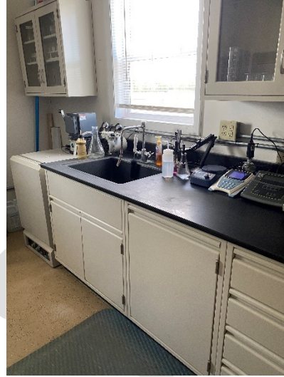
Unisex Restroom Sink