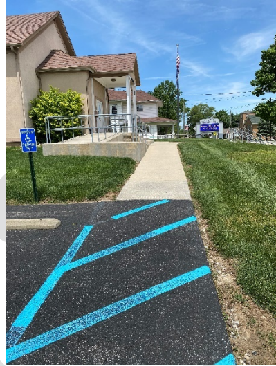
Parking Lot (2)